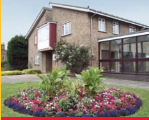
RODDONS HOUSING ASSOCIATION