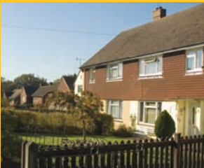
MOLE VALLEY HOUSING ASSOCIATION