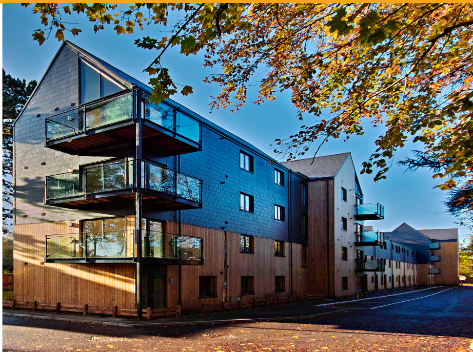
Outlook Place, Watford

Our Development Services team delivers wide ranging and flexible packages both for our internal registered providers and for over 15 external organisations.