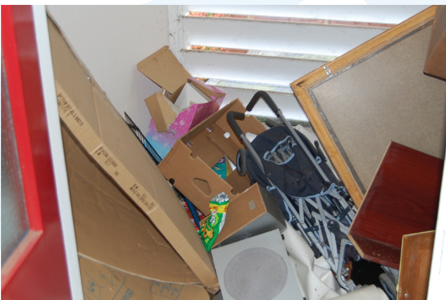
Pictured above – example of a dry room on recent inspection

residents to use for the specific purpose of drying laundry, and not for personal storage or rubbish. A list is being compiled of all flats that have items left in the rooms, and we will shortly be removing and disposing of the items accordingly. Continued misuse of these rooms may result in the association removing the privilege. Many thanks for your cooperation.